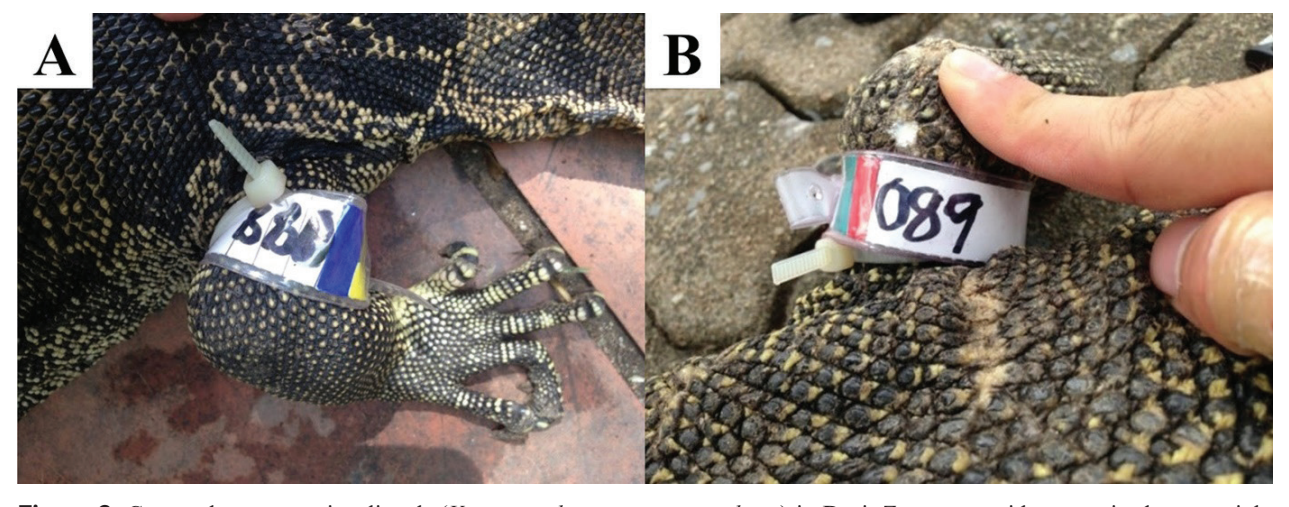
Figure 2. Captured water monitor lizards ( Varanus salvator macromaculatus ) in Dusit Zoo range with customized tag on right axilla. A. Male number 088 with snout-vent length \leq 60.0 cm; and B. Female number 089 with snout-vent length between 90.1 and 120.0 cm.

movement for changing position; 2) foraging activity moving towards prey, hunting, or consuming resources, including the classification of predation behavior into two types (grouped predation, which is predation performed by more than one individual, and solo predation, which is predation performed by an individual); 3) surveying activity – moving for a long distance or time without direction towards nearly attractive thing; 4) floating activity-floating or slowly swimming within a small area in water; and 5) sexual activity – a period wherein each individual displays some pre-courtship or courtship behaviors. Additionally, the calculation of disappeared individuals, referring to those that disappeared or were unable to be observed during the study, was determined for each hour to be included in the analysis of activity rates. This was done by subtracting the number of observed individuals from the total count of tagged individuals (number of disappeared individuals = total count of tagged individuals - number of observed individuals).