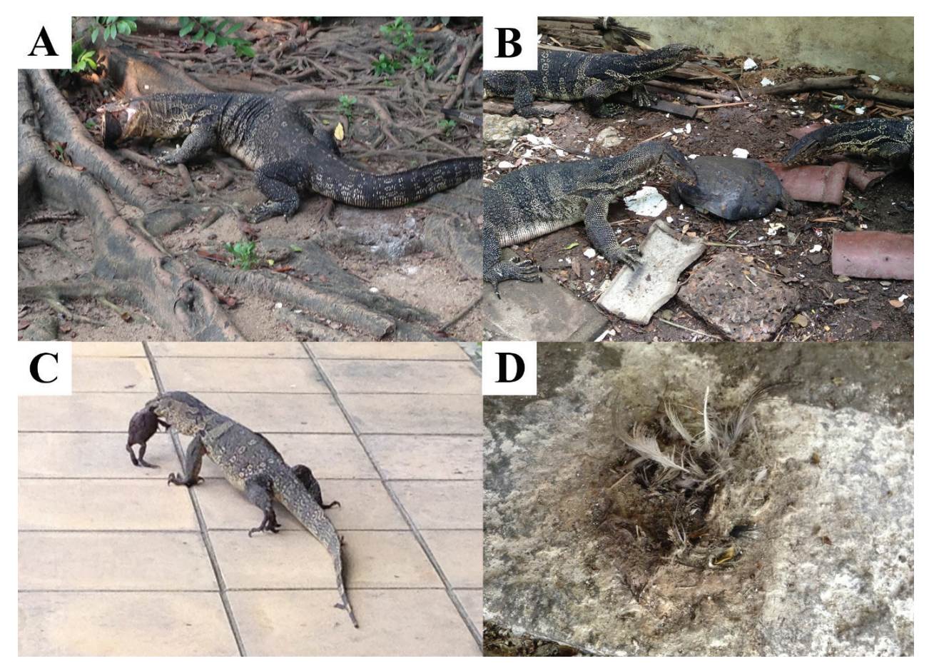
Figures 4. Diet evidence of water monitor lizards ( Varanus salvator macromaculatus ) A. Asian box turtle ( Cuora amboinensis ); B. Chinese softshell turtle ( Pelodiscus sinensis ); C. Asian common toad ( Duttaphrynus melanostictus ); and D. Feather of mynas ( Acridotheres sp.) in stool.