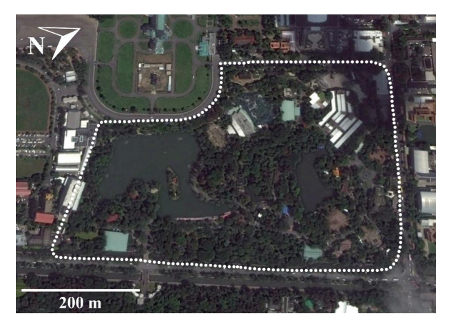
Figure 1. Study area of Dusit Zoo range, Bangkok, Thailand (Google Map 2015).

During the period of 2 to 30 June 2015, catchable subadult and adult water monitors in the Dusit Zoo range (13°46'18.58"N, 100°30'57.98"E) were captured using a noose pole, excluding those with a snout-vent length (SVL) of less than 30 cm, which are considered juveniles (Fig. 1). The direct sampling method was used to