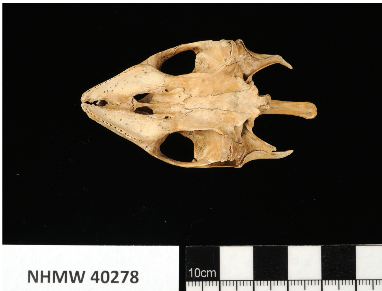
Figure 4. Holotype (NHMW 40278) of A. o. jongli ssp. nov. Skull in ventral view.

Amyda o. phayrei differs from the other two subspecies by its dull brown carapace, yellow pigments present forming distinct yellow dots on the head and neck; carapace with or without distinct saddle-shaped dark colouration; with eyes open, the eyelids have distinct yellow spots alternating with grey “zebra striped” colouration; tubercles in the nuchal and back region of the carapace but not as distinct as in A. o. jongli ssp. nov.; head in upper side view more slender and narrowed to the pro-