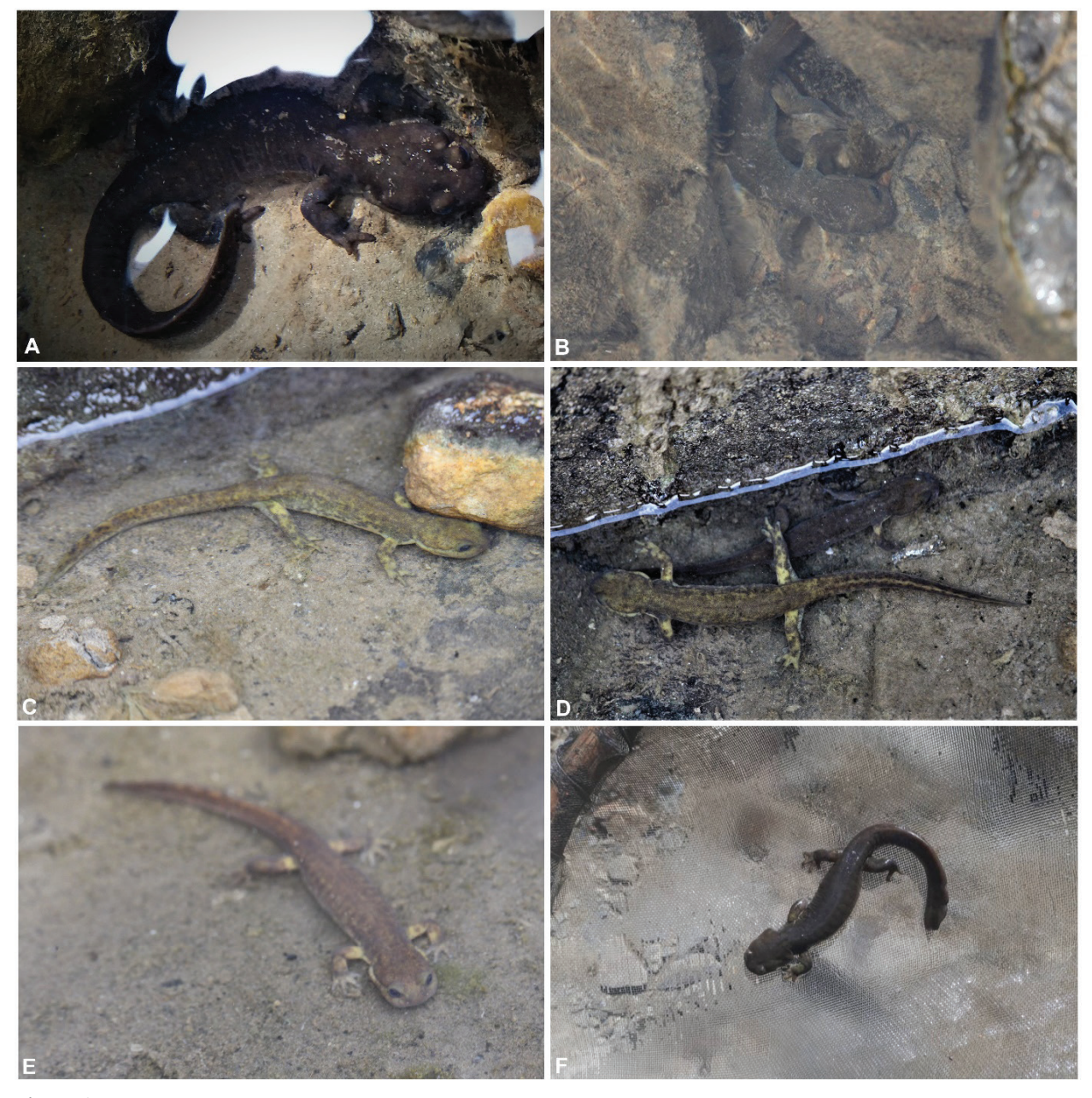
Figure 3. Observed individuals of Paradactylodon (Afghanodon) mustersi from: A, B. Paghman stream, Kabul Province, May 11, 2018 and April 8, 2017, respectively; C, D. Shutul Valley, Panjsheer Province, November 9, 2018; E. Salang Valley, Parwan Province, May 5, 2019; F. Qal'ah-ye Salim Khan, Farza District, Kabul Province, July 24, 2021 (PMNH 2263).

our visits. All individuals were adults (sex was not determined) and each of them had 14 coastal grooves extended to their tails. Their total length ranged from 92.0 to 160.0 mm, a tail length between 45.2–75.6 mm, head length 14.8–20.0 mm, and abdomen width 12.7–18.3 mm. The coloration of the body was dark brown to yellowish olive, in some individuals indistinctly speckled with tiny dots (Fig. 3C, D). The tail is oval at the base but flattening at the end.