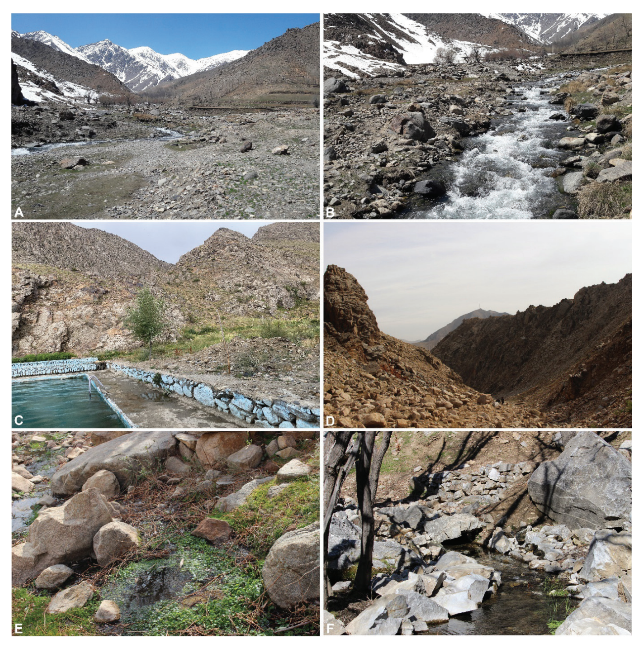
Figure 2. Localities and habitats in Afghanistan where Paradactylodon (Afghanodon) mustersi were observed. A , B . Paghman area, Kabul Province (three individuals at April 8, 2017); C . Paghman area, Kabul Province, a human-made pool (one individuals, July 15, 2021); D , E . Shutul Valley, Panjsheer Province (five individuals, November 9, 2018); F . Gardana Qalatak area, Salang, Parwan Province (three individuals, May 3, 2019).

Two field surveys in Gardana Qalatak ( 35.2317^{\circ}N , 69.2086^{\circ}E , 2,009 m; Fig. 1, loc. 9; Fig. 2F) of the Salang Valley in Parwan Province resulted in observations of three individuals (Fig. 3E). These were found under rocks in shallow water, where the stream flow was relatively low, as well as near springs that produced cooler water ( 10.8 \ ^{\circ}C ) than that of the stream. One individual was found during the 2018 December investigation in running water and was fully active. Vegetation that covered streams included N. officinale , Schoenoplectus lacustris , and Cynodon dactylon . This locality confirmed the historical records of the species in the Salang area.