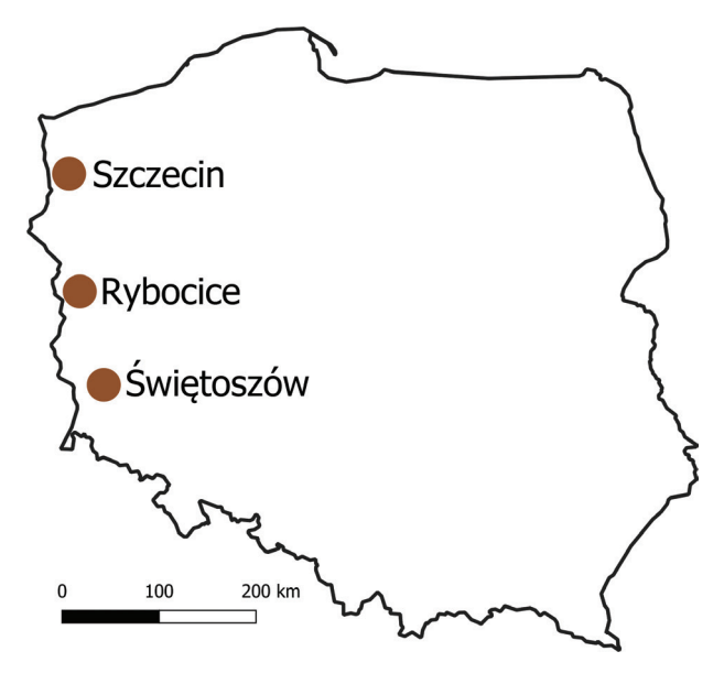
Figure 1. Location of the study sites.

The CR set did not allow obtaining high quality radiographs due to their significant overexposure. The obtained images were highly fogged and the anatomical details were not discernible. The DR set with automatic exposure parameters provided slightly fogged images which were also of insufficient quality. Manual adjustment allowed to