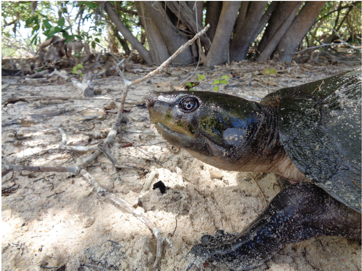
Figure 1. Representative Peltocephalus dumerilianus in a lake on the Tapajós River.

2007), much of the information about its biology is only available in natural history notes, in languages that are not easily accessible, or dissertations and theses that are often difficult to find. This makes it difficult to evaluate the current knowledge on the species. Furthermore, some aspects of the biology of P. dumerilianus can become an obstacle for data collection. For example, it mainly inhabits the bottom of black water bodies (Vogt 2008), making research in a natural environment particularly costly, and possibly discouraging studies on it.