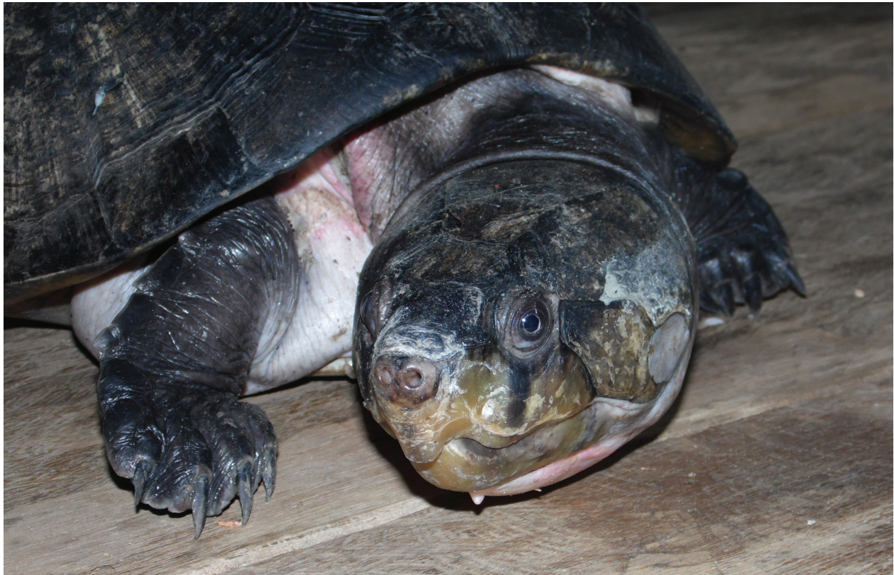
Figure 2. Adult Peltocephalus dumerilianus . Note the shields in the superior and lateral regions of the massive head.

It has undergone a several of nomenclature changes, including being placed in the genera Podocnemis Wagler, 1830 and Chelys Gray, 1831, and following a variety of misidentifications and synonymies, such as Podocnemis dumeriliana , P. tracaxa , and Peltocephalus dumeriliana . Some taxonomic revisions were carried out from specimens that historically were often taken abroad, mainly to European countries, for diverse scientific (and non-scientific) purposes. The first records are from the 1820s of specimens deposited in zoological collections in the United Kingdom (Boulenger 1889), Germany (Hoogmoed and Gruber 1983; Franzen and Glaw 2007), France (Bour 2006), and the Netherlands (Hoogmoed and Gruber 1983; Hoogmoed et al. 2010). The first known accession of this species in a Brazilian zoological collection took place in 1897, in the Museu Paraense Emílio Goeldi, Belém (Sanjad et al. 2012).