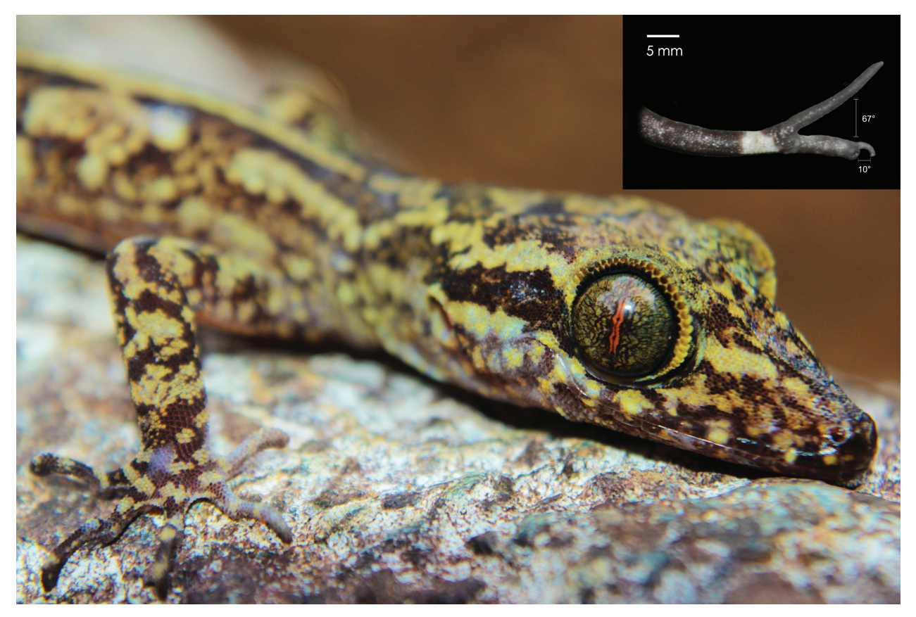
Figure 1. Tail trifurcation in Cyrtodactylus mamanwa on Unib Island. Note the distinct appearance, color, and pattern of the regenerated secondary tail (top), and the supernumerary tail at the tip of the original regenerated tail.

distinctive eyelashes with yellow coloration. The dorsum portrays moderate longitudinal dark bands projecting from the anterior to the posterior (Welton et al. 2010), with hindlimbs and forelimbs forming an asymmetrical stripe extending to its digits. We observed lizards actively foraging and feeding on cockroaches, termites, and small arthropods at night. We located them in limestone outcrops, rock crevices, and tree trunks in mixed agricultural areas and secondary growth forests over limestone karst habitat at night, and found them utilizing cave walls, tree branches, and underneath a decaying log for shelter and refuge during the day.