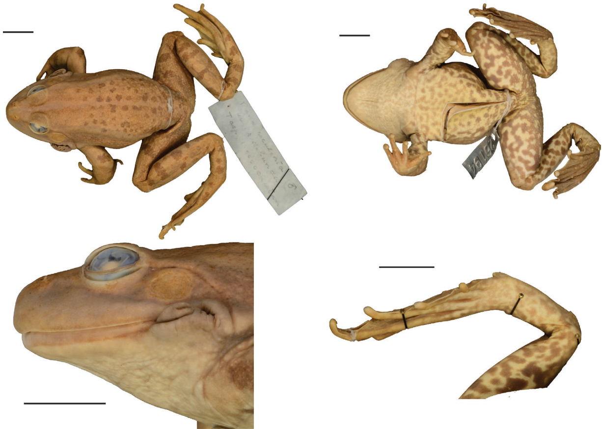
Figure 2. The voucher specimen of Pelophylax sp. USNM 26194, adult male. Scale bars correspond to 1 cm. Photo credit Esther M. Langan, modified by Glib Mazepa.