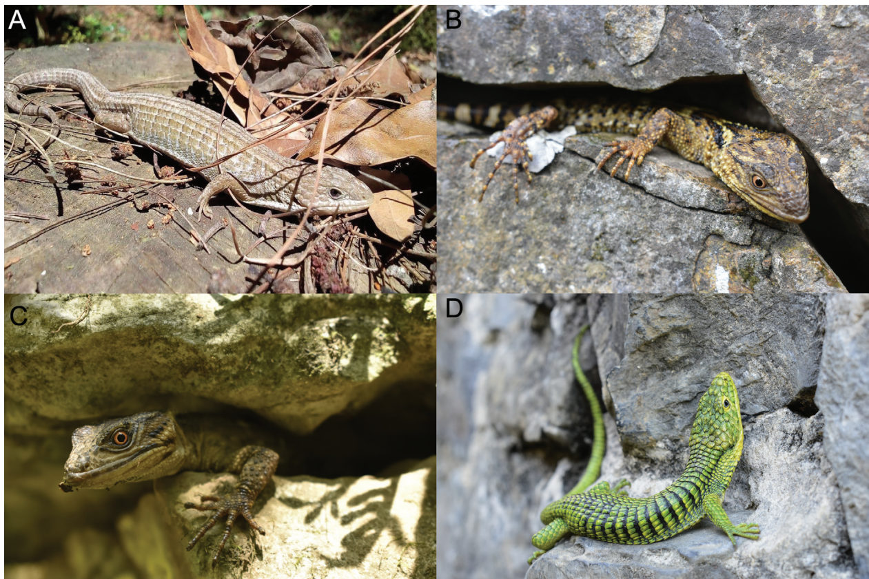
Figure 1. Photographs of A) Barisia imbricata , B) Xenosaurus fractus from Tlatlauquitepec, C) Xenosaurus fractus from Xochititan, and D) Abronia graminea .