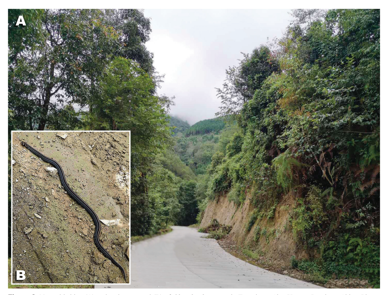
Figure 3. Natural habitat (A) and a photo record (B) of Oligodon hamptoni in Tengchong City, Yunnan Province, China.

While the resolution of the photographs and video taken prevent us from obtaining accurate scale counts, we can confidentially identify the specimen to O. hamptoni based on a combination of color pattern characteristics and body