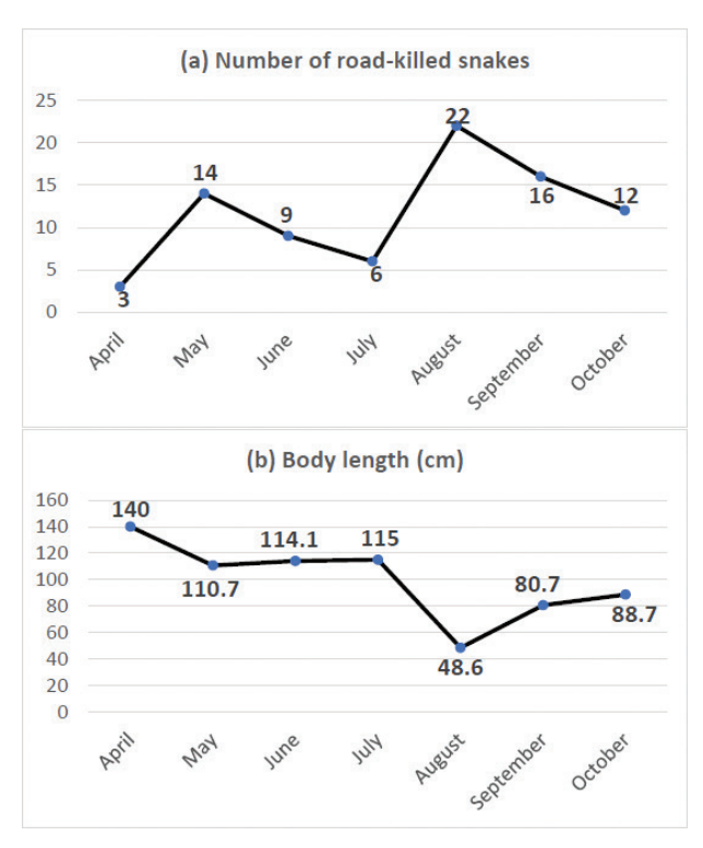
Figure 1. Number (a) and average body length (b) of individuals in each month.

their average size ( r^2 = -0.93 , p = 0.002, N = 82). Mortalities peaked in May and August (Fig. 1a). The average size of snakes was 90.3 cm (112.5 cm, if we exclude juveniles). The size of females varied between 27.5 and 150 cm, with an average size of 89.9 cm (101.1 cm, if we exclude juveniles). In males, the length varied between 27.5 and 160 cm, but the average size was 96.8 cm (121.7 cm, if we exclude juveniles).