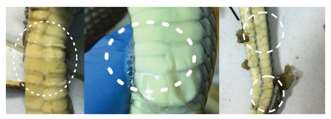
Figure 3. Anomalies of the subcaudal (left) and ventral (middle and right) plates.