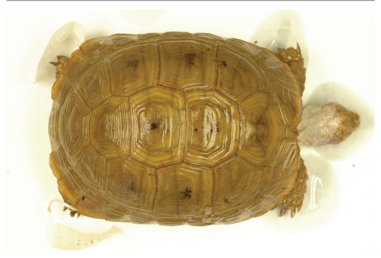
Figure 2. MNHN 0.1937., designated Neotypus of Testudo graeca mauritanica , dorsal. (Photograph: A. Ohler).