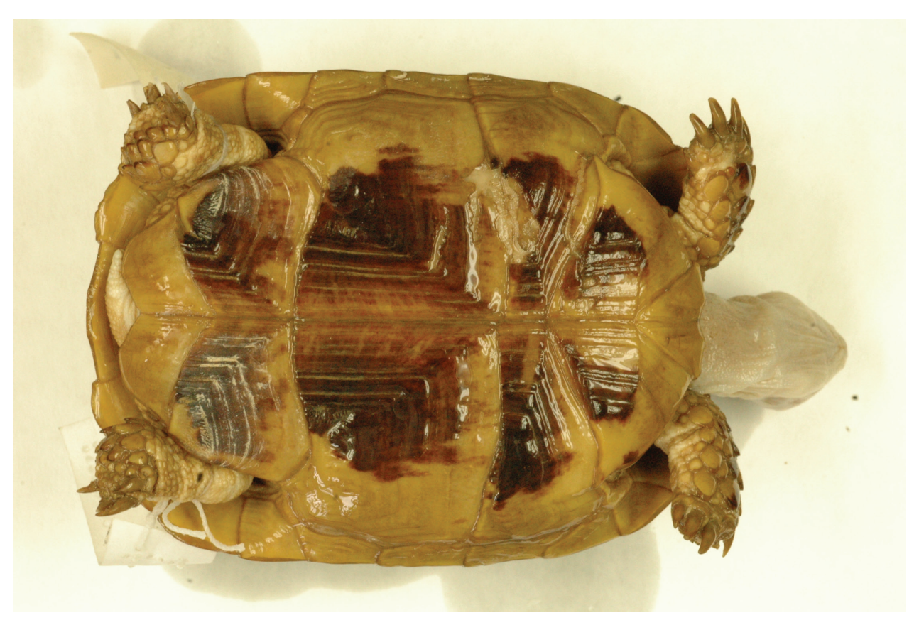
Figure 4. MNHN 0.1937., designated Neotypus of Testudo graeca mauritanica, ventral. (Photograph: A. Ohler).

Testudo graeca, Fritz et al. (2009) investigate the mitochondrial phylogeography in the Western Mediterranean as well as Graciá et al. (2017) in a wider context. In their taxonomic conclusions they assign the four mitochondrial genetic lineages to the six subspecies so far described in this area.