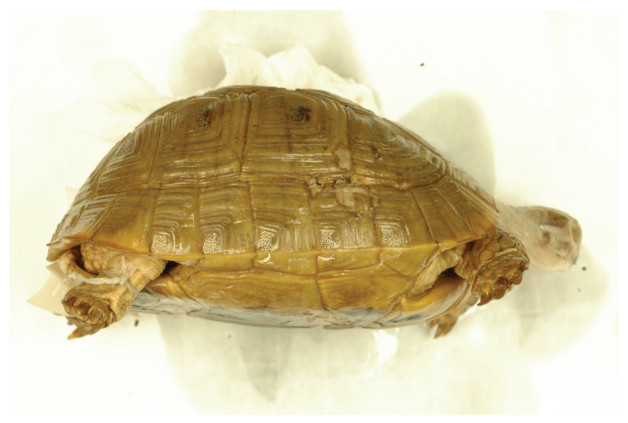
Figure 3. MNHN 0.1937., designated Neotypus of Testudo graeca mauritanica , lateral.