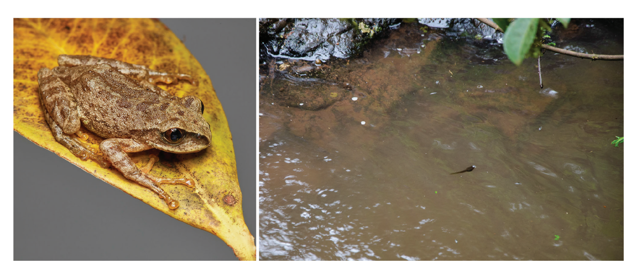
Figure 1. Adult L. ragazzii (left), brown phase, captured in grass about 30 cm from the stream where we discovered swimming larvae (right).

The illustrations (Figs 2, 3) were performed in Adobe Illustrator by one of the authors (AT) from one of the voucher specimens (ZSM 286/2018), soon after its preservation. The mouthparts of L. gramineus shown in Fig. 3 were depicted from the specimens of a parapatric population from Bale Mountains high plateau (ZSM 18/2917 and 19/2017).