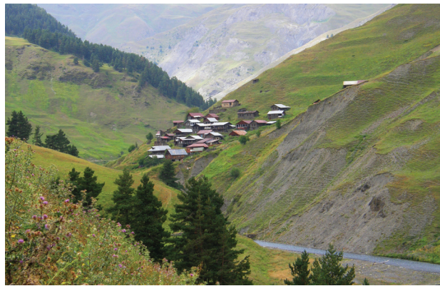
Figure 3. The vicinity of Dzhvarboseli village.

Because the systematics of the D. (saxicola) complex is controversial (Tarkhnishvili et al. 2016), it is necessary to compare the morphology of specimens from the western populations and new geographically remote population of D. brauneri , to obtain genetic data. For this reason, we do not present here the definition of subspecies.