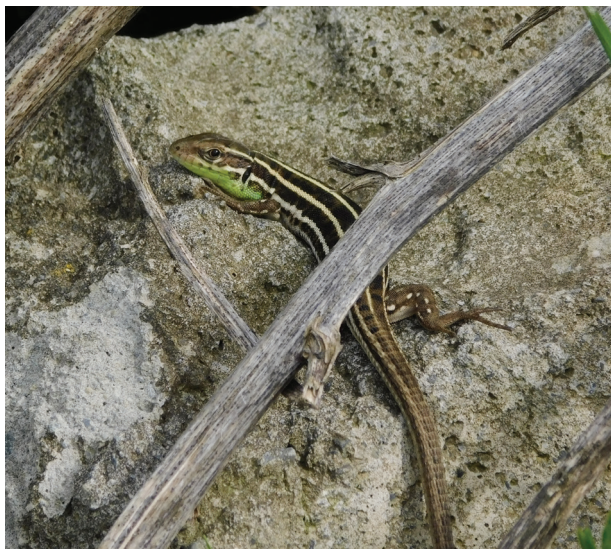
Figure 5. Lacerta strigata Eichwald, 1831, Tianeti village.

Note. L. (Longitudo corporis) – length of body from tip of snout to cloaca; L. cd. (Longitudo caudalis) – tail length: [–] tail regeneration or missing; Pil. (Pileus) – length from the tip of snout to the posterior edge of the parietal shields; Lt. c. (Latitudo capitis) – maximum width of head; Al. c. (Altitudo capitis) – head height near the occipital scales; Mas. (Masseteric) – the presence and size of the central temporal scale: [++] very large, [+] large, [(+)] mid-sized; Mas./Tym. (Masseteric/Tympanum) – the number of scales along the most narrow distance between the central temporal and drum scales; Sup. gran. (Supraciliary granules) – the number of granules between the supraoculars and superciliaries scales; Sup. (Supratemporalia) – the number of scales along the edge of the parietal shield for supratemporals; G. (Gularia) – the number of gular scales line between the middle of the collar and a compound mandibular scales; Sq. (Squamae) – the number of dorsal scales in a transverse row around the middle of the body; P. fm. (Pori femoralis) – the number of femoral pores; Pr. an.1 (Scuta preanal) – the number of preanal scales in the front row; Pr. an.2 – the number of enlarged preanal scales.