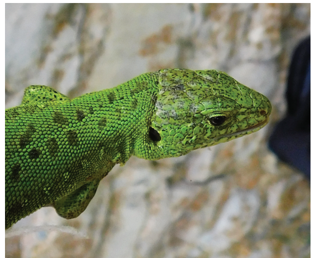
Figure 6. Lacerta agilis ioriensis Peters et Muskhelischwili, 1968, Tianeti village (ZISP № 29878).

September 1, 2009, R. Nessing (2011) was able to find only 3 specimens.