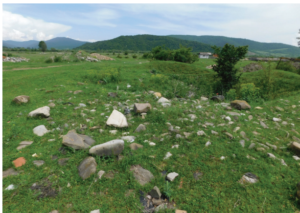
Figure 7. The valley of the Iori River in the Tianeti village.

(following the classification of populations of this species in the monograph Yablokov 1976), making this one of the rarest taxa in the genus Lacerta . In our opinion, the main natural limiting factors for this subspecies are the severe mountain climate and competition with L. strigata . We identified an anthropogenic factor causing destruction of its habitat, namely extraction of sand and rubble from the river valley. Due to its limited distribution and small population size, this lizard is very vulnerable and can rapidly disappear under adverse conditions. The effective method of protection could be the use of zoo culture and the creation of new populations through the reintroduction of captive bred lizards. Although this is a promising direction for protection of the herpetofauna (Ananjeva et al. 2015), we believe that the most effective conservation can be achieved through the creation of a protected area at this territory and a long-term monitoring of this population.