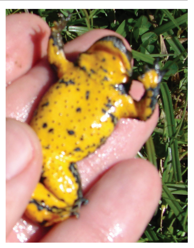
Figure 2. Adult Bombina variegata (Linnaeus, 1758) (ZMUA 4000) from south Euboea, Greece.