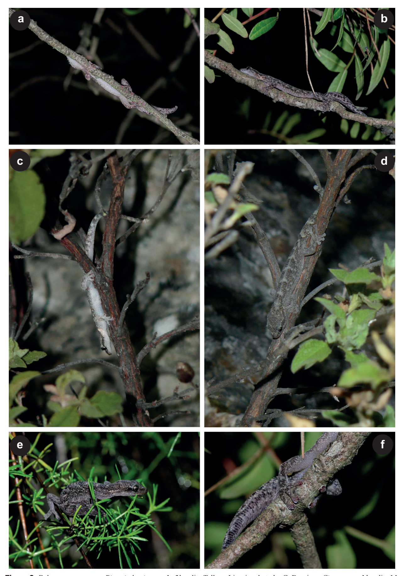
Figure 2. Euleptes europaea on Pistacia lentiscus a, b, f locality Tellaro, Liguria; photo by G. Bruni; on Cistus sp. c, d locality M. Albo, Sardinia; photo by D. Salvi; and on Asparagus aethiopicus e locality Tellaro, Liguria; photo by G. Bruni.