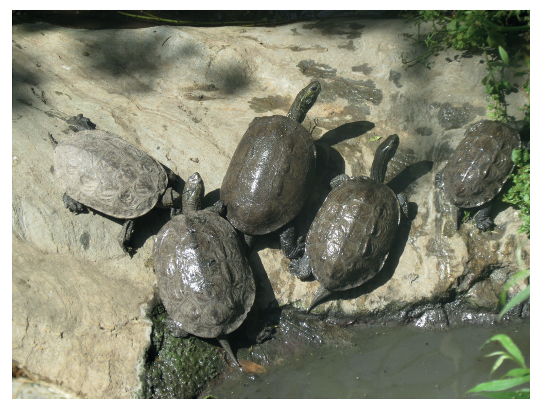
Figure 5. Mauremys rivulata in sewage water of the Chora on Kythnos (8.6.2021).