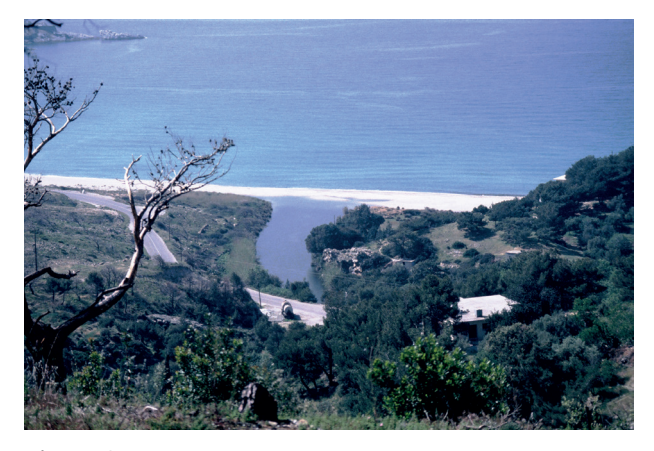
Figure 2. Ikaria-Armenistis: Due to beach wall formation, the running waters are dammed back and form suitable habitats for the Balkan Terrapin (April 1986).

Our second visit to the island in 2000 confirmed the wide distribution in the north-west at all altitudes. However, the large populations seem to have halved (Broggi 2001). With this wide distribution in the northwest clear, the species should not yet be endangered as such. Oefinger (2019) reports hand-tame terrapins feeding at the Myrsonas stream on Ikaria in June 2019 (Fig. 3). For his part, Grano (2020) notes at the same site