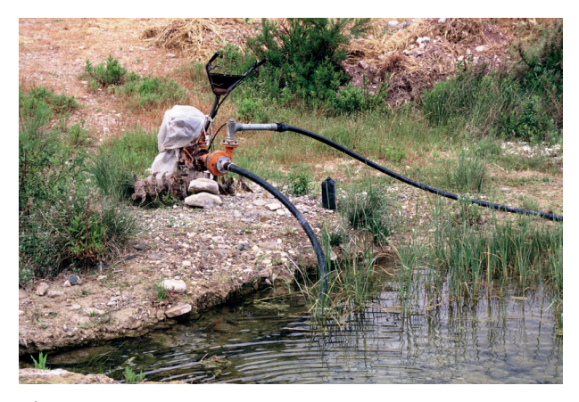
Figure 6. Water abstraction for agriculture endangers the habitats of the Balkan Terrapin (Limnos, April 2016).

In sections where there is still a long period of water retention in the watercourse, and the water in scours is retained for longer, refugial populations of M. rivulata can settle best. I have noticed such stream colonisations away from the estuary in Thassos, Samothrace, Andros, Lemnos, Kythnos, Kea and Serifos. But even in these more favourable conditions, water is being extracted for agriculture, accelerating their drying out. In addition, most of