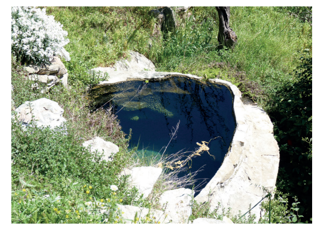
Figure 7. Open well on Kea (2011).

the natural springs are exploited. The Balkan Terrapin can also resort to using anthropogenic water accumulations such as open cisterns and sites for livestock watering (Fig. 7). However, such artificial biotopes are becoming rarer. They are replaced by closed cisterns and groundwater pumps, and the once-open waterholes for amphibians and hydrophilic reptiles are no longer maintained. The loss of open water areas is also exacerbated by ongoing climate change. In the last two decades, drying out has intensified (Fig. 6). For example, on some islands such as Lipsi, Fourni, Ithaca or Alonissos, no flowing water could be seen from April onwards. On the other hand, winter flash floods can carry turtles all the way into the sea and thus endanger their populations, as experienced in Kea (Broggi 2012). If turtles wash up in new areas, the probability of finding suitable habitats is extremely low.